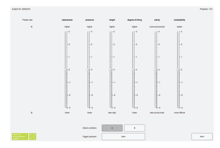
Figure 2: A screenshot of the questionnaire GUI in MATLAB. "A" refers to the reference, whereas the condition under test is labeled "B".

In the experiment, the subjects were presented two conditions at a time, i.e., the reference and a condition under test (which was either the stereo anchor or one of the upmixed versions). After having listened intently to both conditions, the subjects were asked to rate the perceived quality of the condition under test relative to the reference. Each of the verbal descriptors had to be rated on a continuous bipolar scale that ranges between \pm 3 , where a value of zero marks the middle ("no difference perceived"). Whereas a positive difference rating indicates that the subject perceived the condition under test to be higher in spatial quality than the reference, a negative difference rating translates to the opposite. To control for possible confounding factors, the musical pieces and conditions were presented in random order. The order of the verbal descriptors was also randomized across subjects, but not varied between comparisons to reduce the cognitive load. The questionnaire which allowed the participants to control the audio playback and enter their